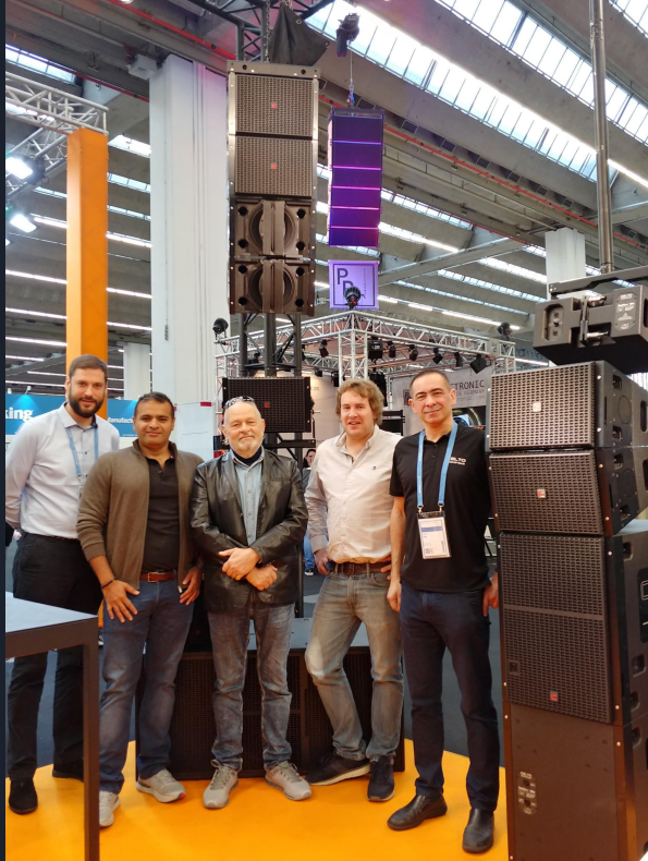
PROLIGHT & SOUND FRANKFURT