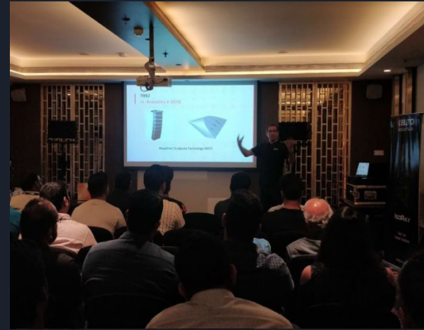
CELTO INDIA LAUNCH